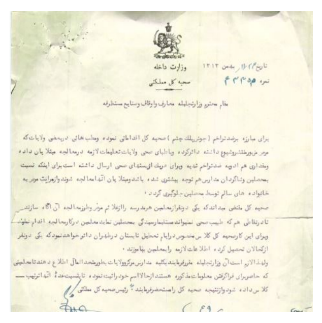
Figure 2. The letter of the head of the general health organization of the country to the Minister of Education regarding the fight against trachoma in 1934