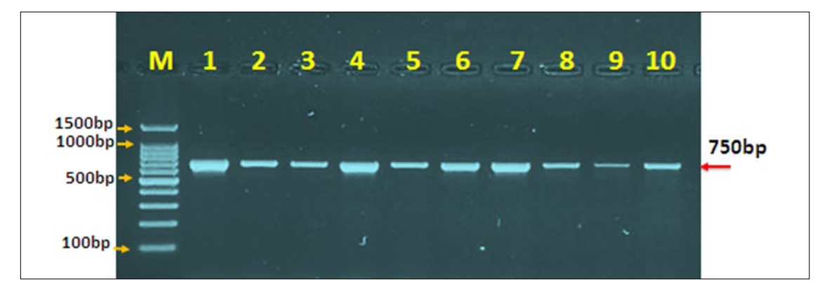
Figure 1. The ITS<sub>2</sub> PCR products run on agarose gel. M: marker (100-1500 bp), lanes 1-10: positive E. vermicularis isolates (750 bp).

Only 32 (57.14%) of 56 samples were confirmed positive by PCR. The analysis of ITS2 in the ribosomal DNA gene of E. vermicularis isolates was confirmed, as shown in Figure 1.