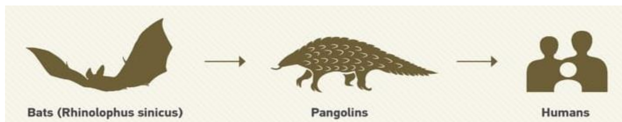
Figure 2. Origin and transmission of SARS-CoV-2, Possible zoonotic transmission

fact that 70% of the anteaters were positive for coronavirus. In addition, the analysis of Whole genome sequencing (WGS) of Pangolin anteater virus showed a nucleotide similarity of 91.02% with the new coronavirus SARS-CoV-2. The sequence of metagenomics sequences of coronaviruses associated with Pangolin scaly anteaters belongs to two subspecies of corona viruses associated with SARS-CoV-2. The discovery of several common lines between the corona of the Pangolin virus and their similarity to the now widespread SARS-CoV-2 in the world suggests that the Pangolins should be considered as possible hosts for the outbreak of the novel corona virus (28).